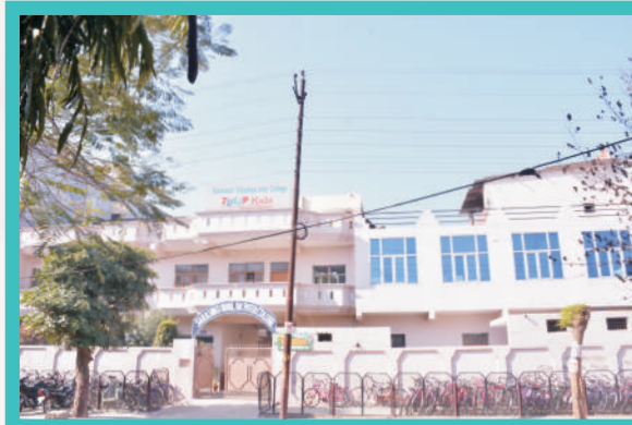
Saraswati Vidyalaya Inter College B-Block, Panki, Kanpur | Affiliated to U. P. Board Class : P.G. to 12 th