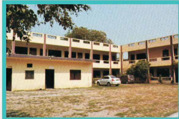
Saraswati Balika Vidyalaya Inter College Vijay Nagar, Kanpur | Affiliated to U. P. Board Class : 1 st to 12 th