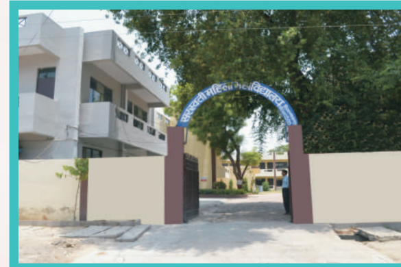
Saraswati Mahila Mahavidyalaya Vijay Nagar, Kanpur | Affiliated to C.S.J.M. Uni. Kanpur Courses Offered : B. A. | B.Sc. | B. Ed. | D.EL.ED