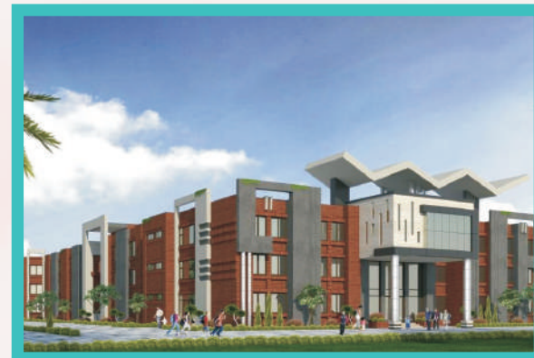
P. D. Nigam International School Akbarpur, Kanpur Dehat