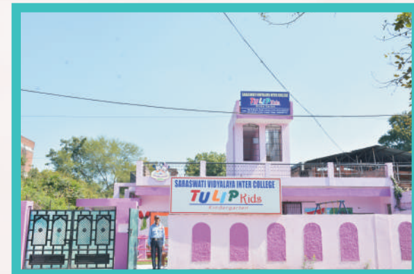
Tulip Kids Pre School Panki, Kanpur Class : P.G. | L.K.G. | U. K. G.